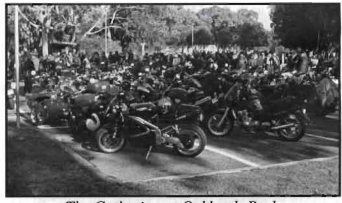
The Gathering at Oaklands Park

The MRA had a meeting with the Minister for Road Safety, Carmel Zollo, to discuss the increase in Ridersafe fees. While the Minister did not budge from the Government's user-pays full cost recovery position, a dialogue was started and our views on this and other issues were listened to. The Minister promised to consider a proposal to discount Ridersafe fees for people on pensions or unemployment benefits. We intend to present the Minister with the views of the MRA on other issues in the future.