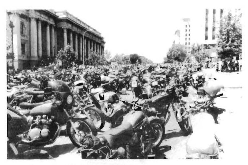
No cars on North Terrace today