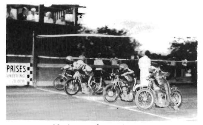
The boys set for another start

We also have many valued sponsors who support us through thick and thin. Not forgetting the St. John Ambulance helpers either.