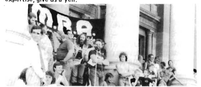
Still waiting for the government to speak — some doubt their ability to address the subject at all.

Footnote— hope this story has filled you in a bit. It's a large and involved subject, but if you have any questions or thoughts, see your MRA committee or write to us. We're also constantly looking for constructive help, so if you've got some expertise, give us a yell.